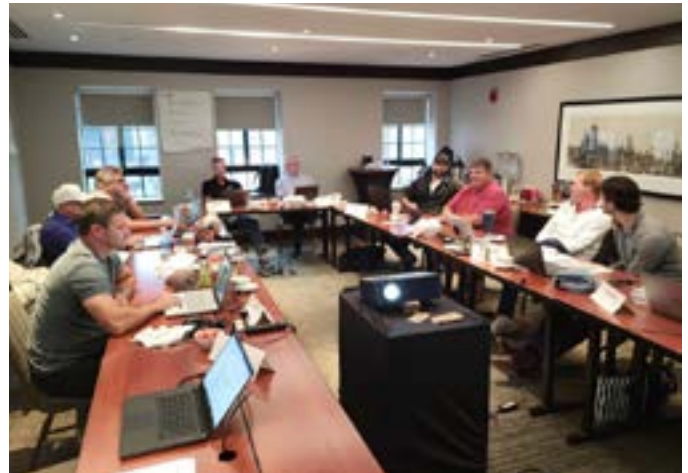
FCIA Board of Directors meets in Portland, ME this August to discuss industry issues and Association work.

Among the other items discussed was the recent legislation in Washington state (and possibly also Nevada) regarding worker certification requirements, additional Programs and